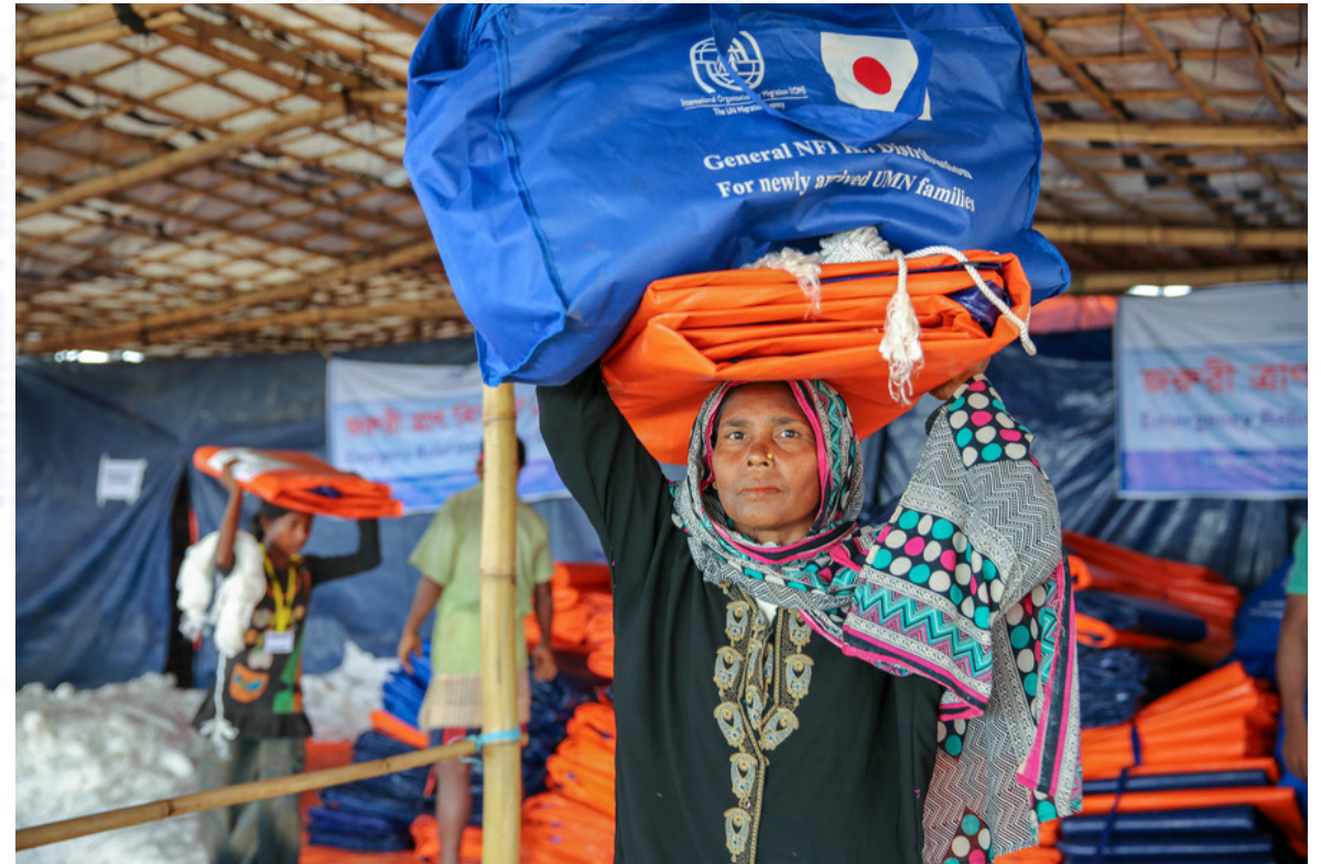
Shelter distribution for Rohingya refugees in Kutupalong settlement