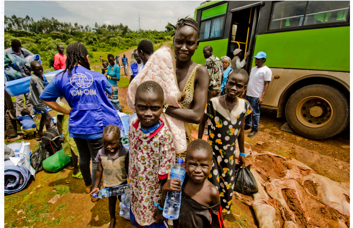
South Sudanese refugees arrive at Gimbi way station.